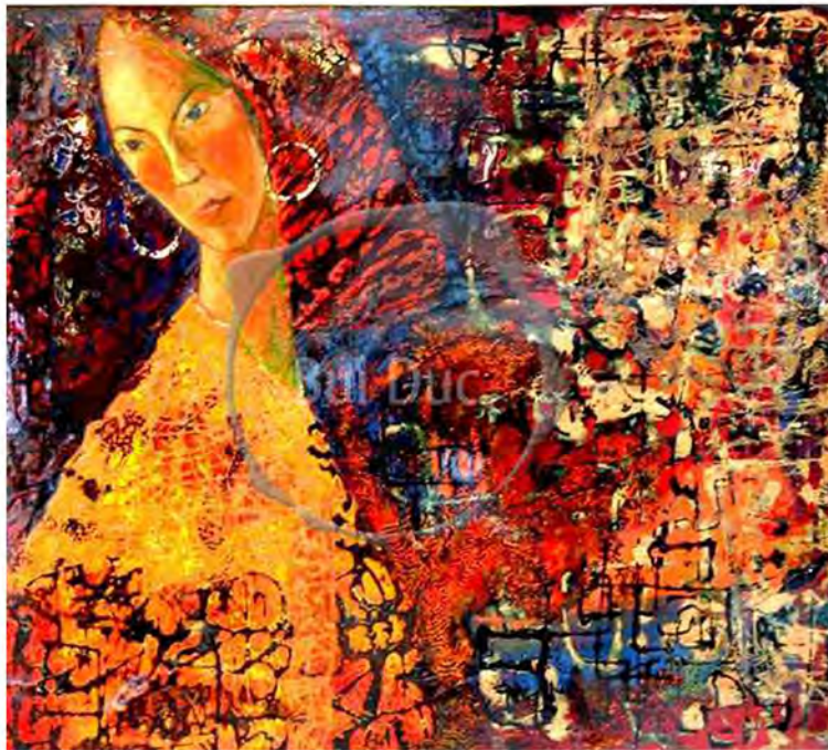
This is how the art will look like in the online gallery. Art by Bui Duc.

For buyers to have the best experience in viewing your work, we require that you upload a high resolution (no more than 2mb), well taken picture of your art work.